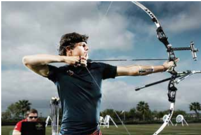
NeuroSky EEG used in conjunction with Olympic teams in United States, China and Croatia to find "the zone."

Experts agree that the human brain should be exercised like other body elements. The all-new MindWave™ headset is designed specifically to identify and monitor electrical EEG from brainwaves for use with specially-designed neuroscience relaxation, mental fitness and game applications. The headset complements its older brother, the MindSet, which has been used by leading research institutions and universities throughout the world in ADHD, Alzheimer's and cognitive stress research. NeuroSky ThinkGear technology is found in more EEG devices than any company on the planet.